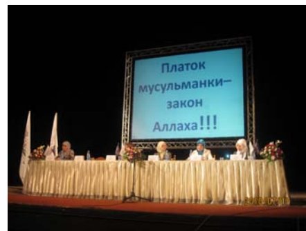
Headscarves of Muslims –It is the Law of God!!! All-Women Conference organized by an independent Islamic organization “Davet.”

Similar to fundamental Christians in the US, HUT members claim to promote principles of religious morality against the dangerous shortcomings of a modern society, including alcoholism, drug addiction, corruption, and promiscuity. They strive for a purified style of Islam, as it was, in their words, “during the Caliphate.” They study Quran and Hadith , but they also believe in ijtihaad (individual interpretation or reasoning). Unlike the mainstream Muslim Crimean Tatars, they reject the veneration of the tombs of saints and even dead ancestors. They do not drink alcohol, and